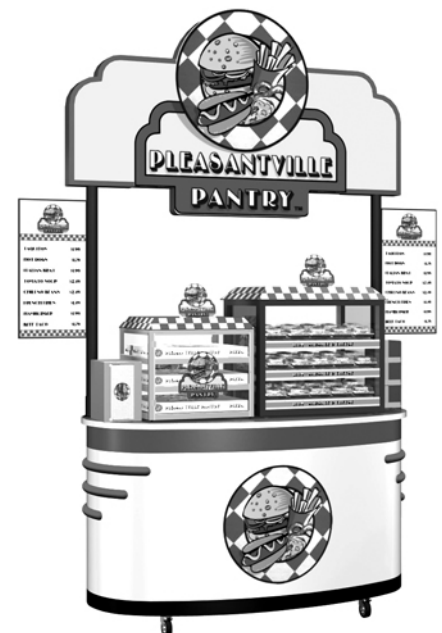
Cart with Optional Header, Menu Board and Cart Graphics plus Food Service Equipment